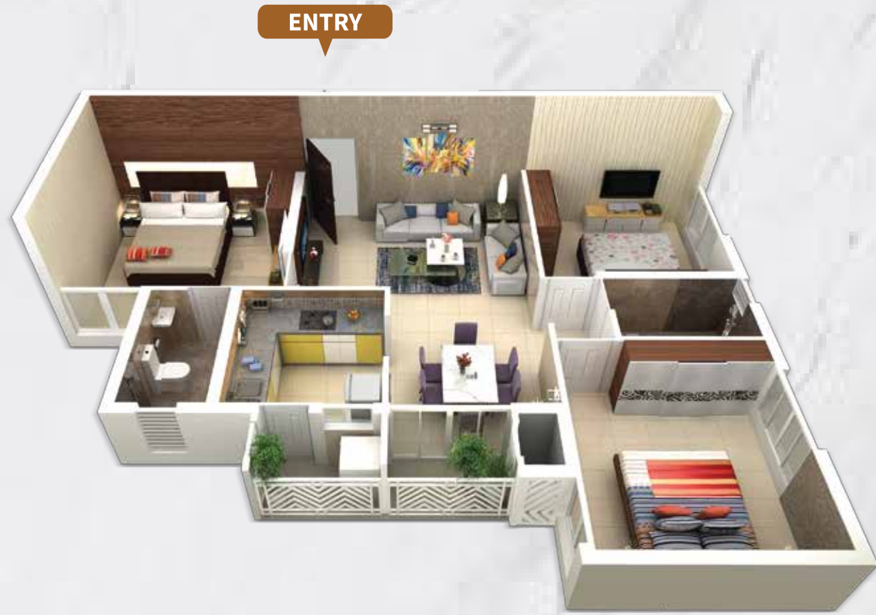
3 BHK + 2T | 1222 Sq. Ft.