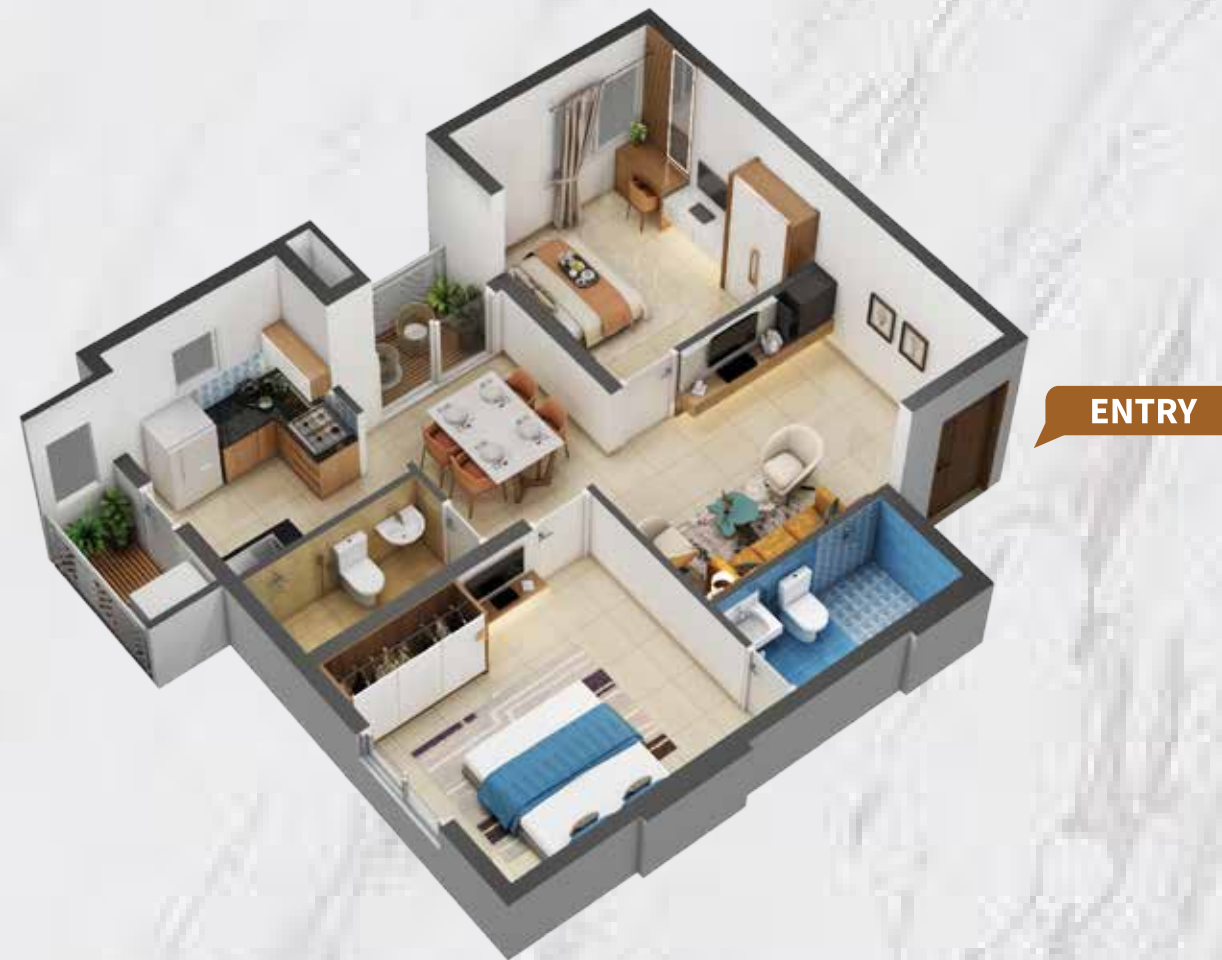
2 BHK + 2T | 922 Sq. Ft.