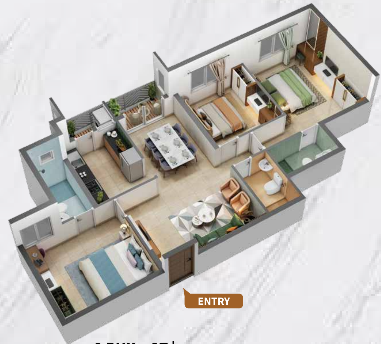
3 BHK + 3T | 1334-1412 Sq. Ft.