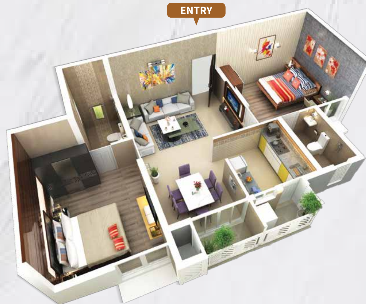
2 BHK + 2T | 1035 Sq. Ft.